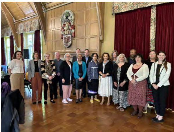
Group photo from the Royal Society's visit to McMaster to learn about the Ohneganos Project.