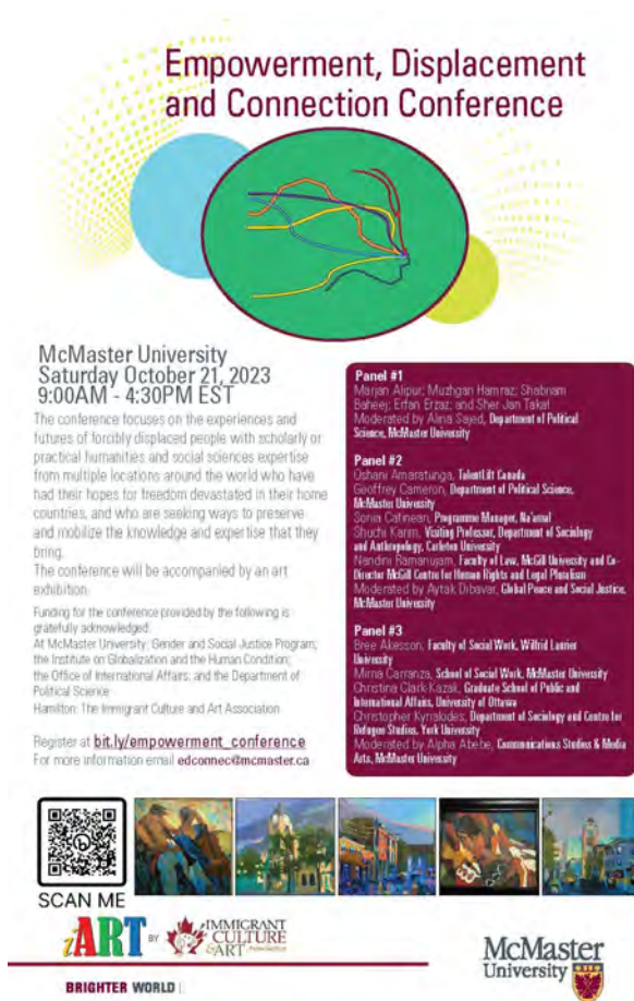
Image of the information poster for Empowerment, Displacement and Connection.

The Empowerment, Displacement and Connection Conference will take place from 9AM to 4:30PM on Saturday, October 21 at McMaster University. The conference focuses on the experiences and futures of forcibly displaced people with scholarly or practical humanities and social sciences expertise from multiple locations around the world who have had their hopes for freedom