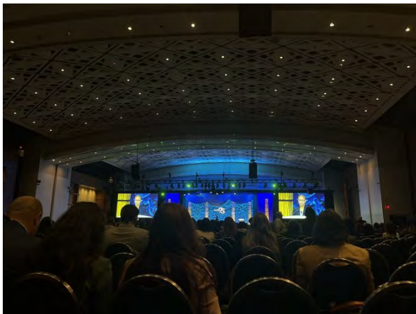
Image of the NAFSA 2023 opening plenary in Washington, DC.