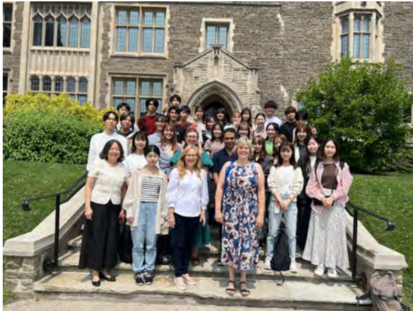
Summer English program group photo.

The Office of International Affairs resumed its in-person Summer Programs for international students during the months of July and August. Despite post-pandemic travel difficulties, we welcomed a cohort of about 80 students from China (Shanghai Jiao Tong University School of Medicine, Fudan Shanghai Medical College, and Shanghai International Studies University) and Japan (Meiji University) to attend our Summer English, eHealth, Strategy and Communication, and the Summer Research Internship programs.